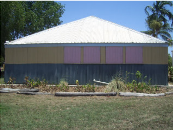
The shutters under restoration

THE HERITAGE BRANCH carried out restoration works on the heritage listed railway refreshment rooms in October. This included replacing rotting timbers, adding a missing internal wall, installing a white ant protection system, replacing old wooden window shutters and straightening a wall. This work was greatly appreciated.