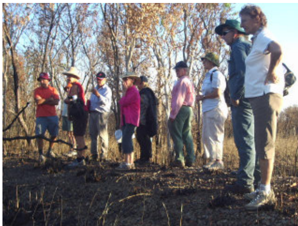
Walkers en route to Batchelor